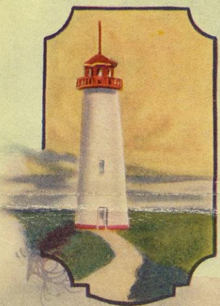
Cove Island Light