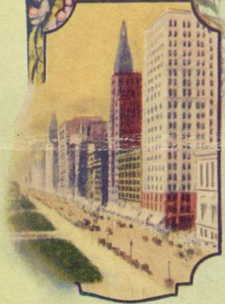
Michigan Blvd Chicago