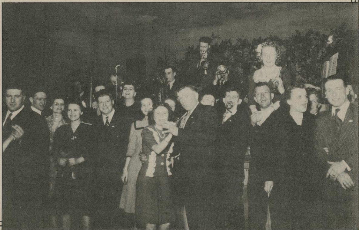
BELOW: Now here's a happy group and gives us an opportunity to prove that there was also some dancing done at the Shrine last Saturday night...not everybody sat around drinking coca-colas.....