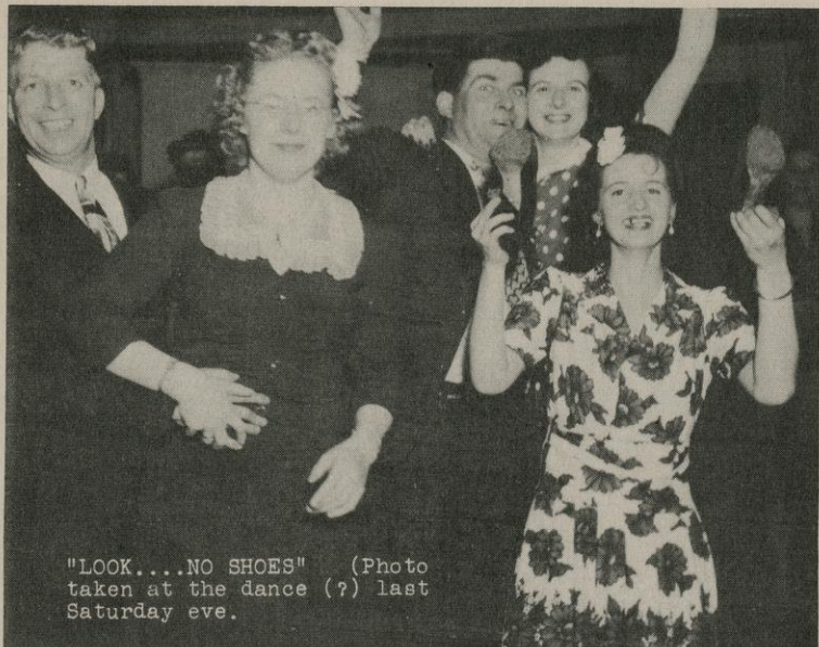
"LOOK....NO SHOES" (Photo taken at the dance (?) last Saturday eve.