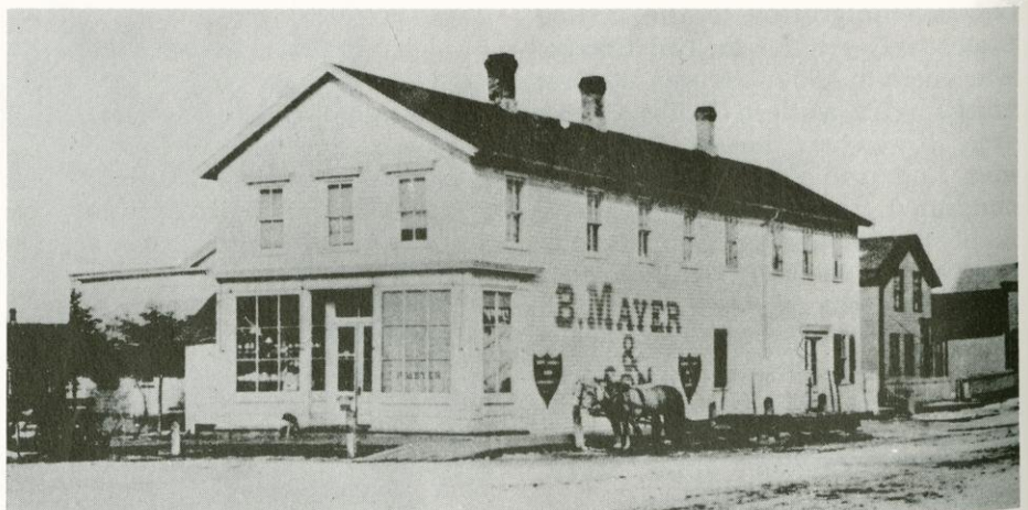
Schroeder's mercantile began in the B. Mayer building, located at the northwest corner of Cedar (now 18th) and Washington Streets, in 1891.