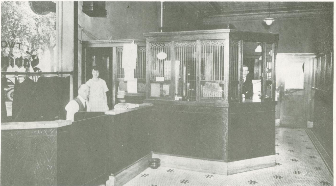
Two Rivers Savings Bank in its corner location in the Schroeder store about 1918.