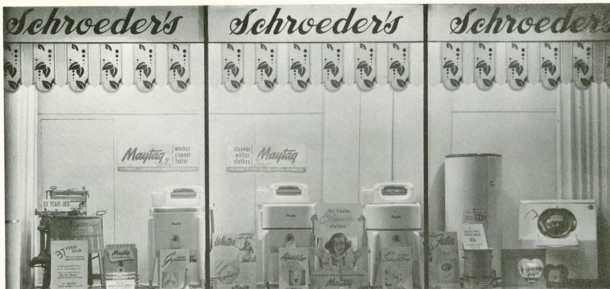
Window display in 1948 for electric household appliances.