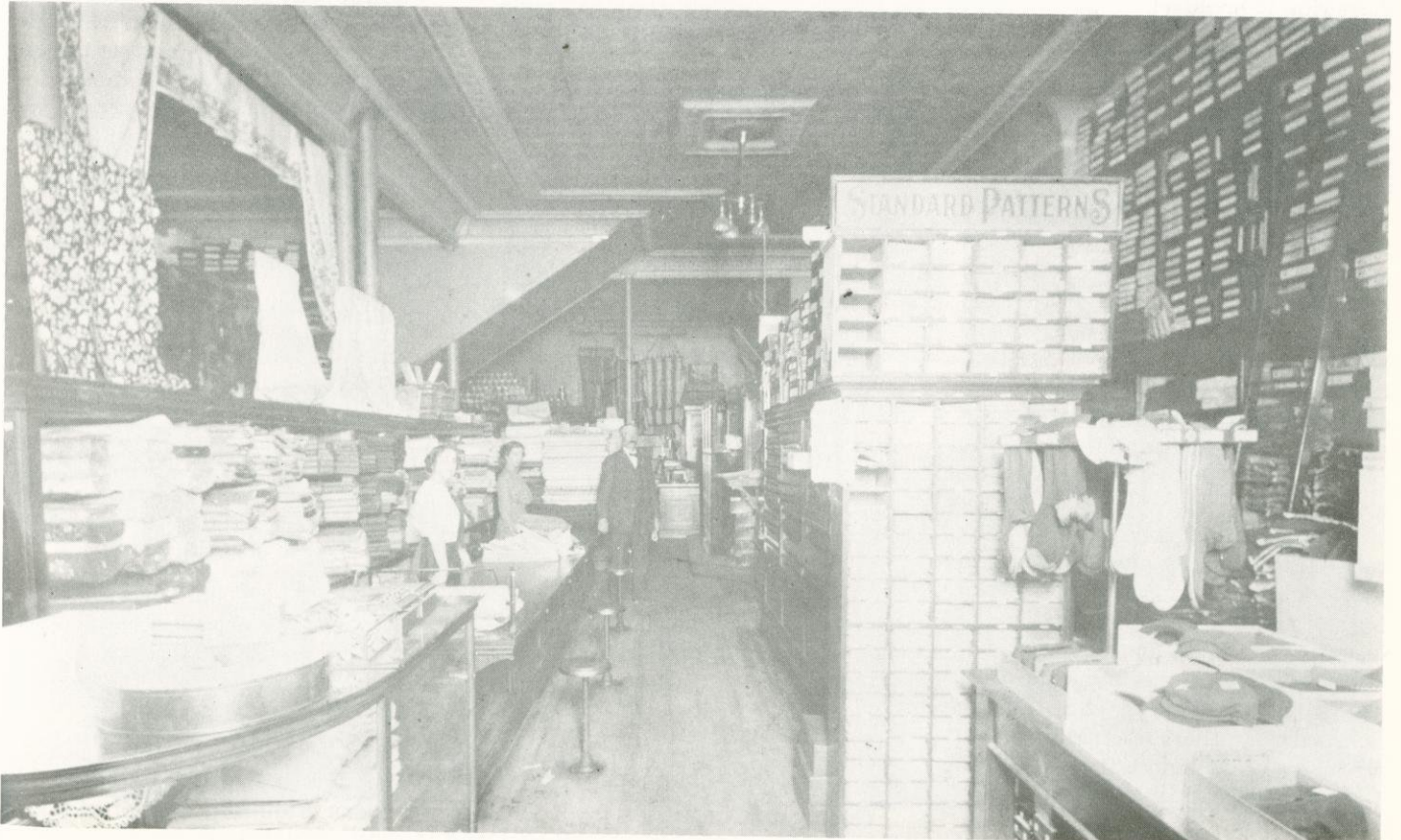
Schroeder's carried a variety of goods in a small space as seen in this first floor view.