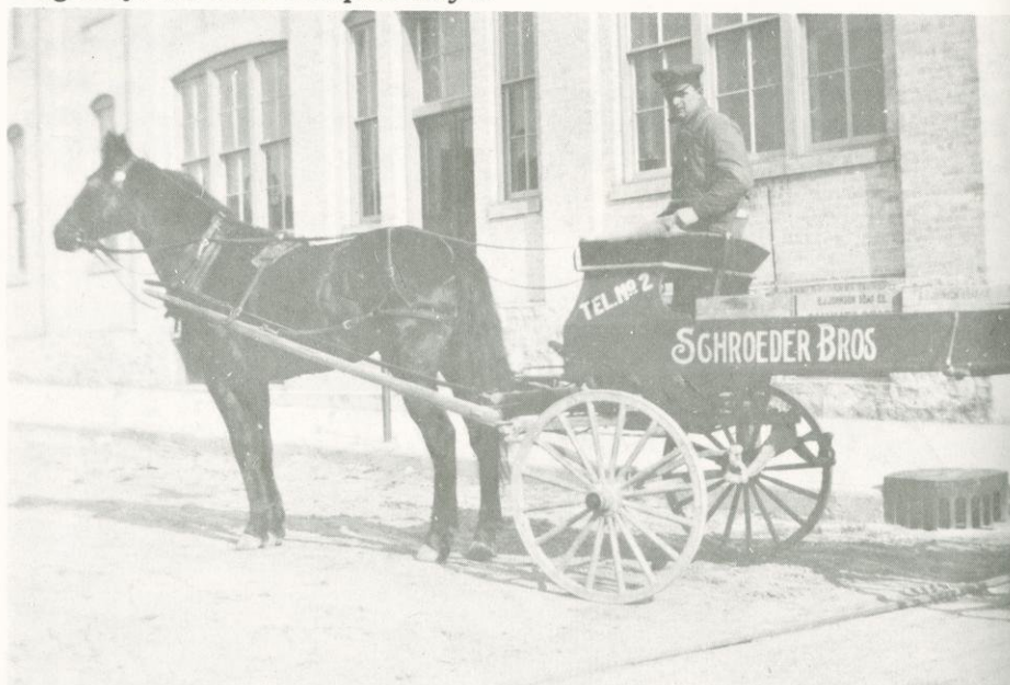
Goods and groceries from Schroeder's were originally delivered by horse and wagon.

Since the original Schroeder Brothers store was built in 1899, it has been remodeled and enlarged several times. The first remodeling occurred in 1915 after a fire, started by a lit cigar in a wastebasket on the