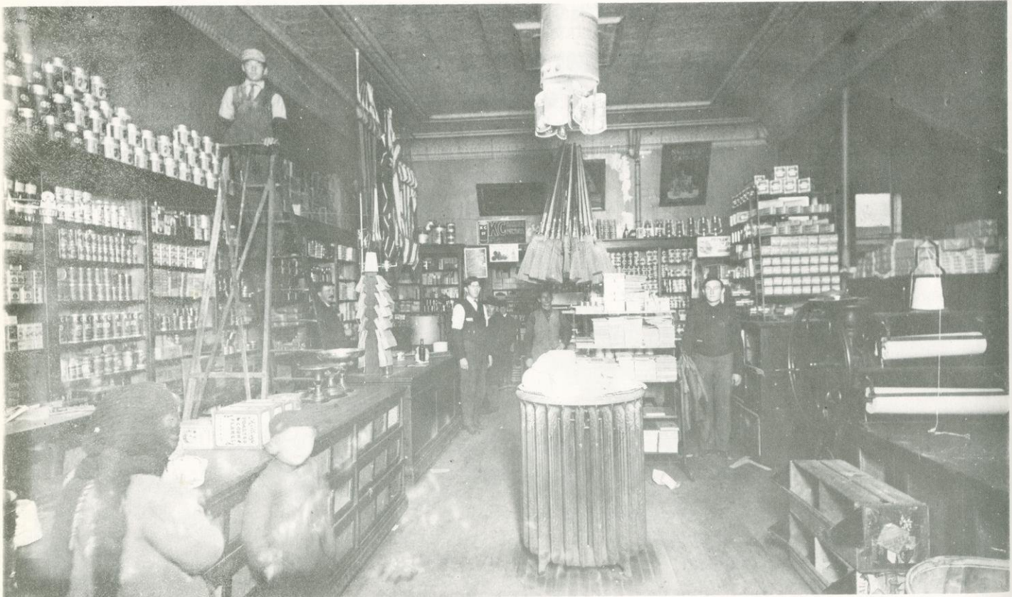
The grocery section before the 1916 addition.