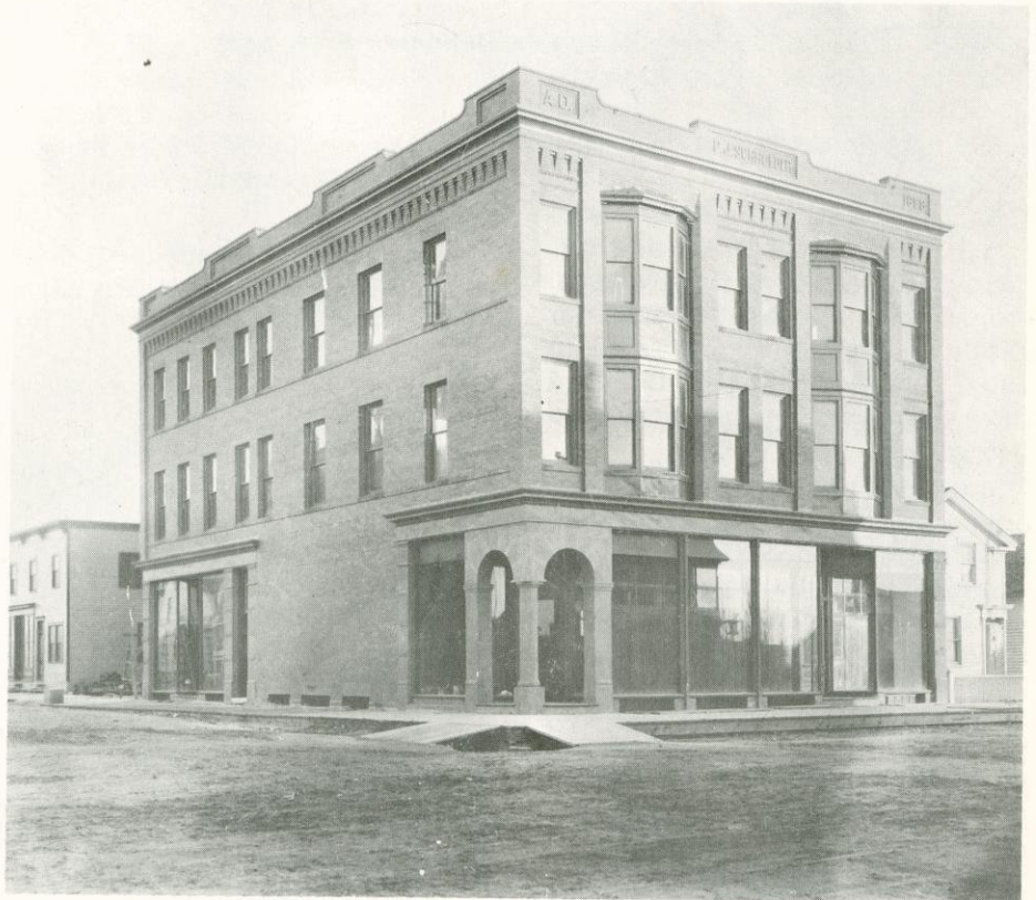
Schroeder Brothers Store soon after its completion in 1899.