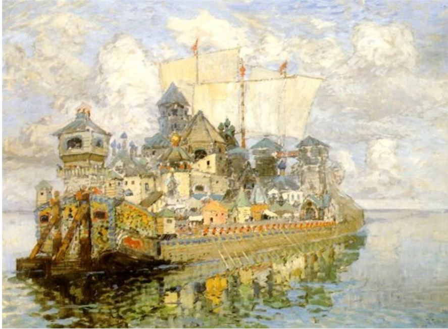
Konstantin Gorbatov, "The Invisible City," 1913