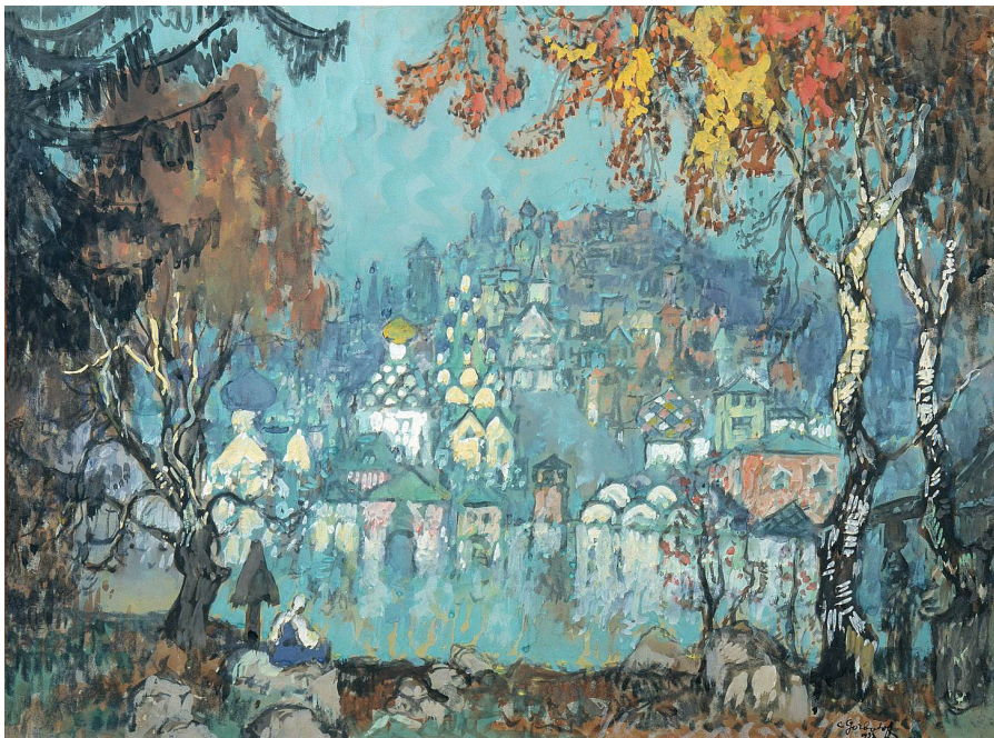
Konstantin Gorbatov, "The Sunken City," 1933.