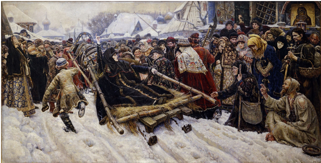
Vasily Surikov, “Boyarynya Morozova,” 1887. Tretyakov Gallery, Moscow.

The final gesture in The Way of All the Earth recreates a specific portrait from Russian history, as Akhmatova-as-Kitezhanka takes on an additional mask, that of Feodosia Morozova, a seventeenth-century Old Believer who became famous through an 1887 painting by Vasily Surikov entitled “Boyarynya Morozova.” The painting depicts a defiant Morozova being arrested and taken away on a sled.