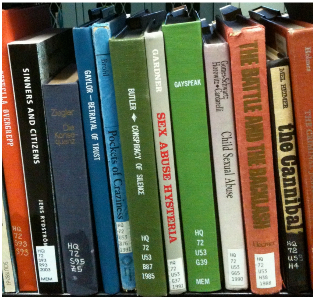
Figure 6. Book on communication styles of gay people shelved next to books about abuse.

communication styles of gays and lesbians, shelved between two books on child molestation, as illustrated in Figure 6. Pietris's explanation leaves out crucial historical details. As the previous chapters have demonstrated, "Homosexuality" was once under the broader heading "Abnormal sex relations," next to other classes of relations considered to be "abnormal," including child molestation and other sex crimes.