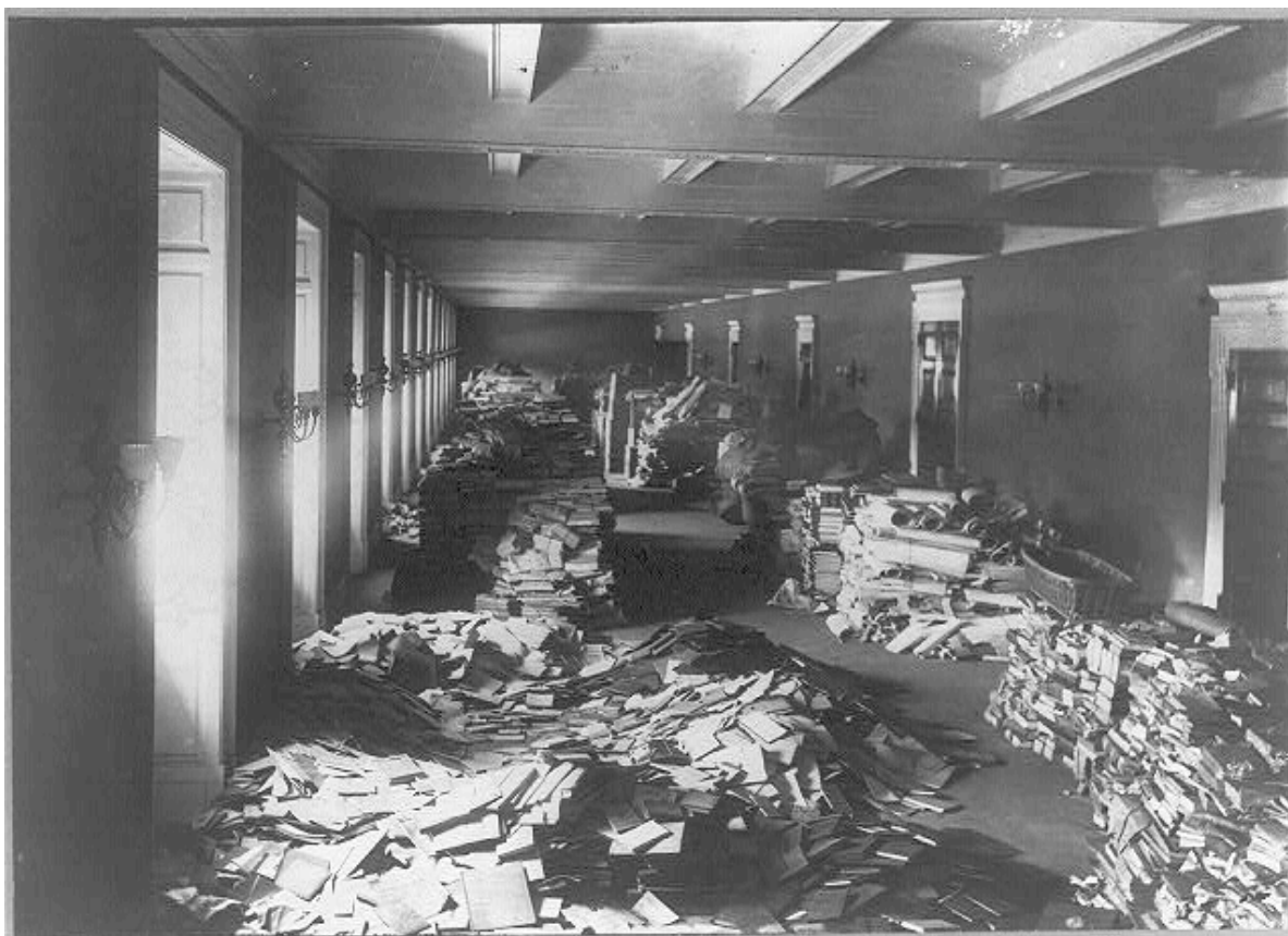
Figure 1. “Copyright Deposits in the Basement before Classifying”