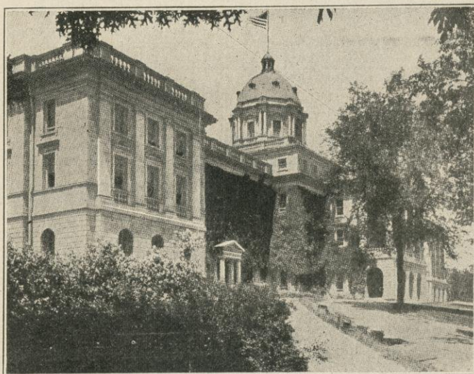
Bascom Hall (Formerly Main Hall)

"A simple hall, the first that domiciled The students and the profs, But in four years a twin across the hillside campus Took its place to keep it company. 'Twas five years more ere the main hall At top of noble upper campus hill Ope'd wide its doors to welcome students in." —From prologue of "On, Wisconsin."