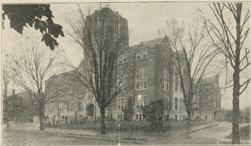
Michigan Union Building

MICHIGAN has already gone over the top with $1,250,000 for their Union Building.