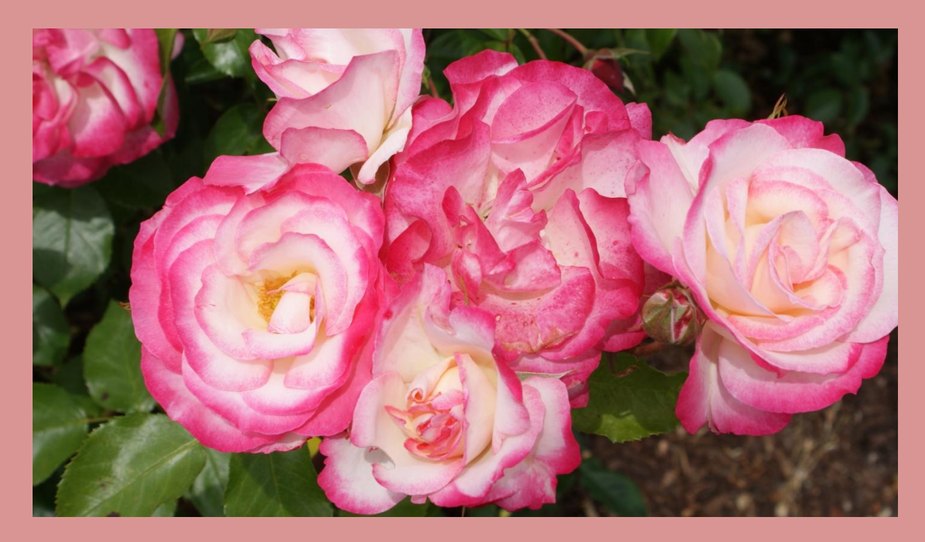
Taken in Marksburg, Germany, in May 2011. Created on Word at El Grito del Lobo Press in May 2014