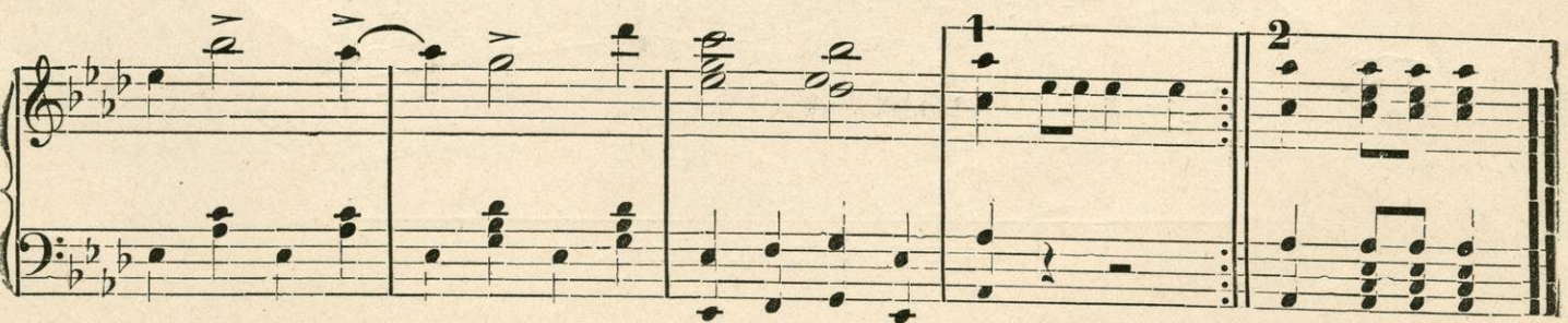
Milwaukee Sentinel March. 3-3.