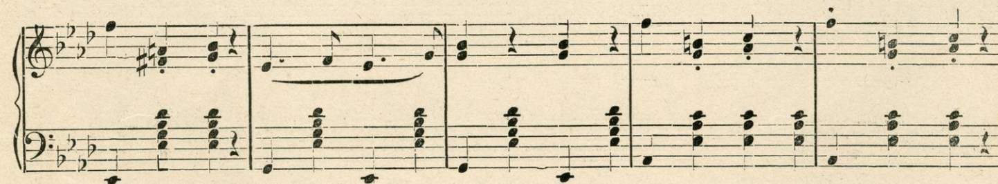
Milwaukee Sentinel March 3-2.