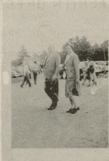
OUR BOSS AND HIS BOSS

Almost all our faults are more pardonable than the methods we think up to hide them. —La Rochefoucauld