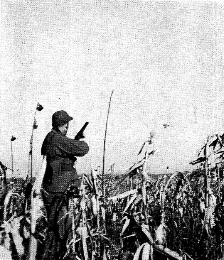
Sporty, natural-type hunting provided on shooting preserves helps relieve the mounting pressure on public hunting lands.

a record of the total harvest. However, 37 operators provided estimates of the number of different hunters using their preserves annually (Table 8). The number of hunters per 100 acres on these preserves was considerably lower than that on 4 state-operated public hunting grounds (Table 9) but preserve figures included only different individuals. The 37 preserves reporting were used by a total of 237 owners or club members annually. Licensees estimated an additional 421-528 guests each year, for a grand total of 658-764 different hunters. The average number of hunters per preserve reporting was 19. Total hunters on individual areas ranged from 3 to 300.