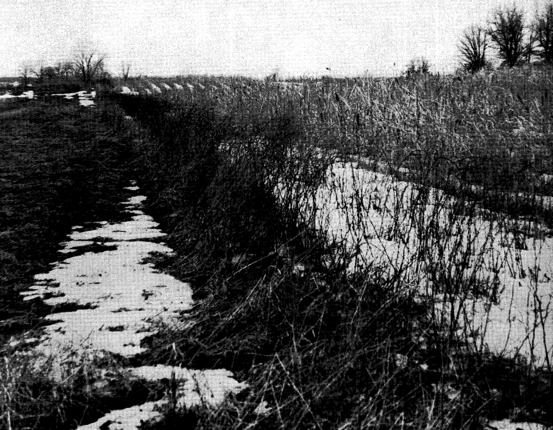
This well-planned layout of perennial cover and annual food plantings on a Wisconsin shooting preserve illustrates the type of habitat improvement made feasible under a preserve license, on land once heavily farmed and grazed, and unproductive of wildlife.

preserve concept may be judged. Evidence obtained in this study, and elsewhere, leads to the conclusion that shooting preserves have operated to the net gain of wildlife and wildlife habitat in Wisconsin, and to the benefit of the public as a whole, during this period. These benefits have accrued at no cost to the public. Some of the positive contributions of preserve shooting—such as absorbing a share of the hunting pressure on private lands, and the preservation of wetland habitat—have only recently become obvious, as these particular problems become acute in the state. These contributions should have increasing significance in the future.