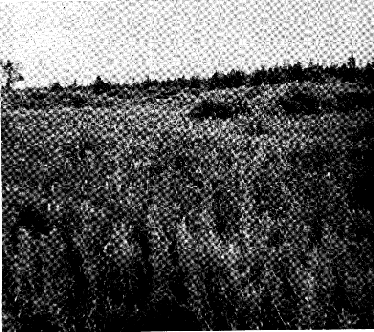
A number of valuable wetland areas in southeastern Wisconsin have been protected from drainage as a result of being licensed as shooting preserves in the 1930's.

inroads in their birds. Foxes, feral cats and dogs were implicated, in that order.