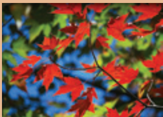
NORMA LARRABEE GABRIEL

Autumn is in full swing and there is no better time to take amazing photographs of Wisconsin's state parks and forests at peak color. Friends groups hold many programs to celebrate fall and Halloween.