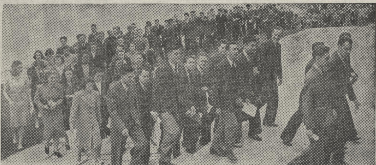
Pictured above are the seniors who were honored at the 1940 All-University Honors Day convocation, which was held as a part of the Parents' Weekend program last spring, filing into the Wisconsin Union

theater where the exercises were held. The Honors convocation will also be one of the outstanding events on this year's Parents' Weekend program, and will be held on Saturday, May 24.