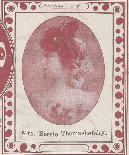
Mrs. Bessie Thomashefsky.