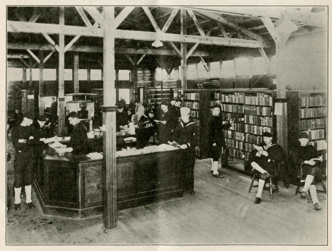
GREAT LAKES LIBRARY