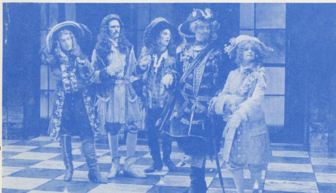
The Acting Company in "The Country Wife"

Money for the project will come from Union revenues. The Wisconsin Union is self-supporting and does not receive any direct state appropriation. The cafeteria dining room refurbishing will include a new floor and ceiling, new lighting, tables and chairs and new wall treatment and will cost $239,000. The total project when finished in approximately four years will cost in the neighborhood of $1 million.