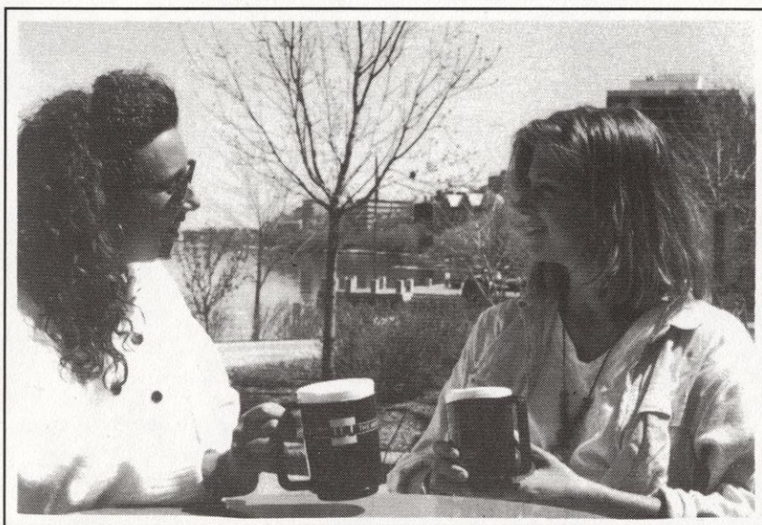
Two students enjoying their mugs.

We raise our mugs to all of you Union members who helped to make this program a success!