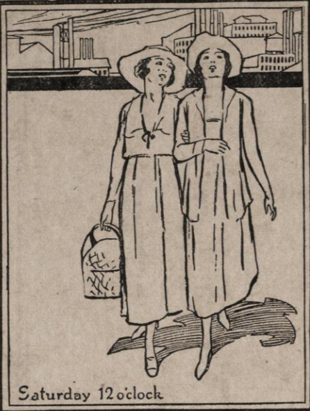
Saturday 12 o'clock