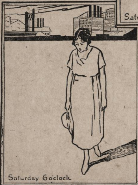
Saturday 6 o'clock