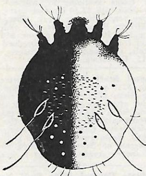
The Sarcoptes scabiei of scabies