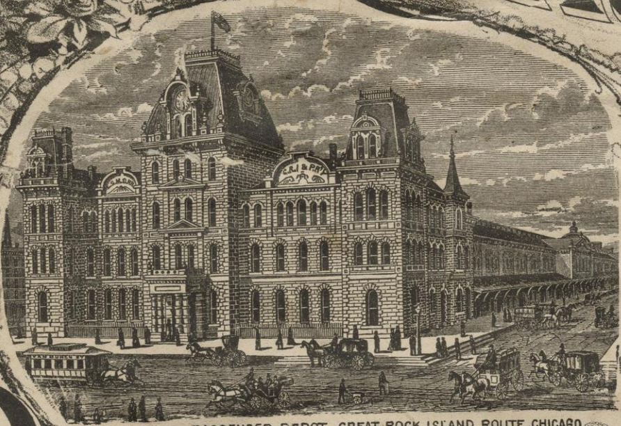
PASSENGER DEPOT, GREAT ROCK ISLAND ROUTE, CHICAGO.