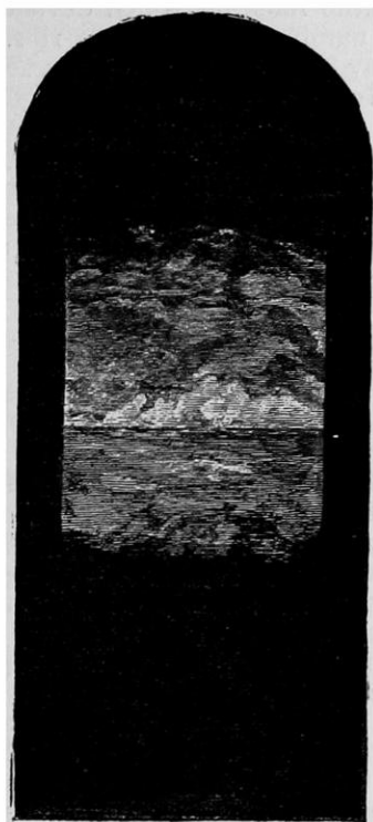
FIG. 1.—Cloud below critical point

"In 1822 Cagniard de la Tour made some remarkable experiments, which still bear his name, and which may be regarded as the starting point of the investigations which form the chief subject of this address. Cagniard de la Tour's first experiments were made in a small Papin's digester constructed from the thick end of a gun barrel, into which he introduced a little alcohol and also a small quartz ball, and firmly closed the whole. On heating the gun barrel with its contents over an open fire, and observing from time to time the sound produced by the ball when the apparatus was shaken, he inferred that after a certain temperature was attained the liquid had disap-