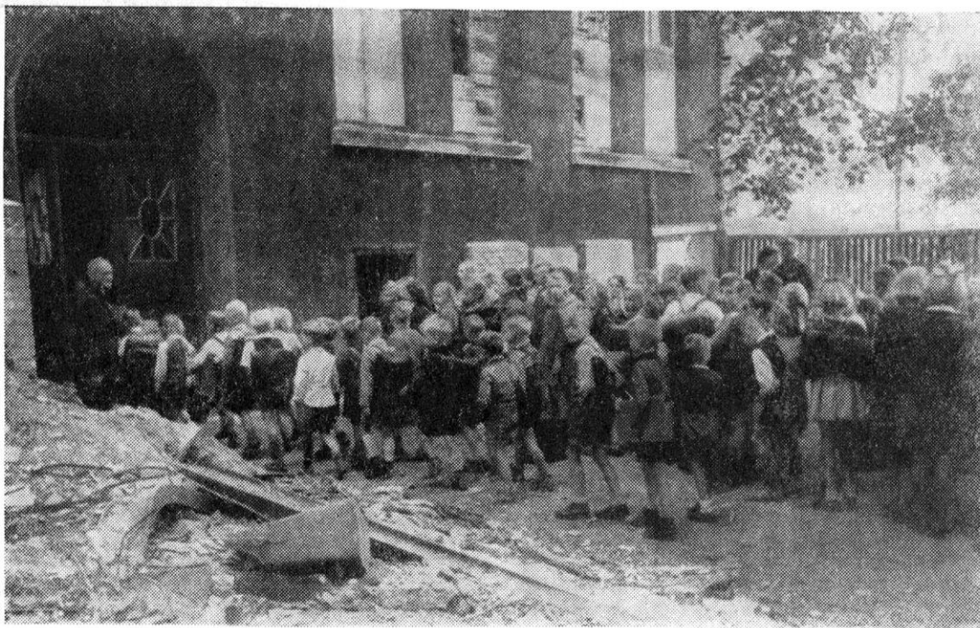
Typical of the conditions prevailing in many of the heavily-damaged cities of the U.S. Zone is this picture of school children entering an elementary school in Bremen on opening day. Unless the boarded windows can be replaced by glass, winter will make the continuance of classes extremely difficult.