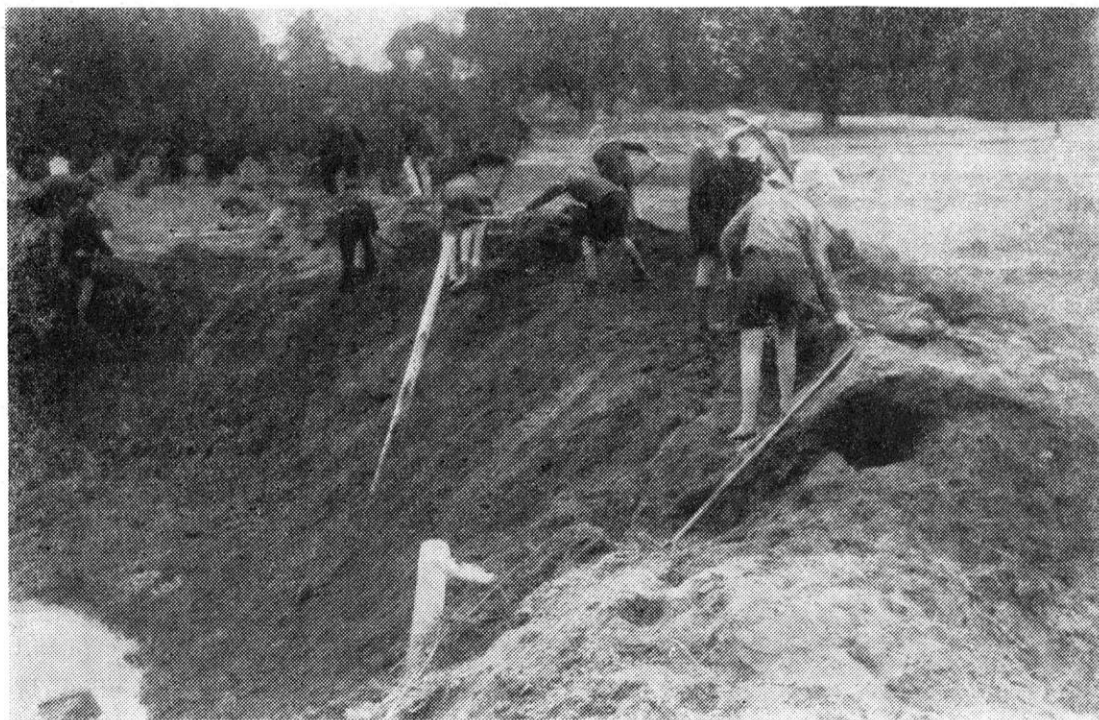
Before the formal reopening of the schools, Bremen schoolboys were kept busy rehabilitating public places under the direction of the local school authorities. These boys of twelve to sixteen were filling shell holes in a church yard. In many cities all over the U.S. Zone, such programs were developed to keep youth usefully employed and off the streets.