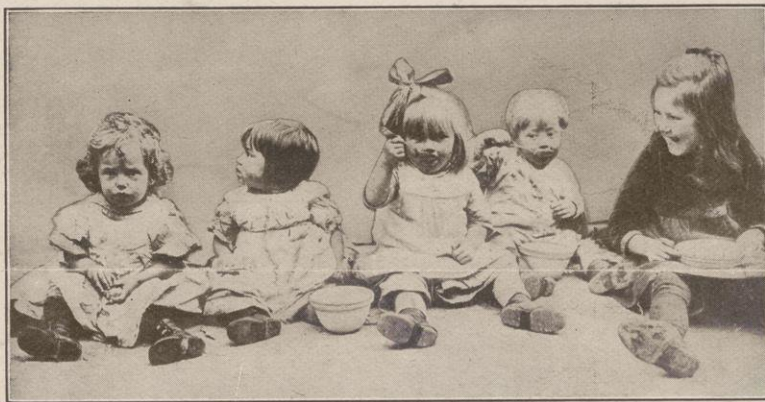
Little French tots, rescued by friendly hands, who are happy because they have something to eat.

Again let us say they are the children of France, living representatives of the best friend America ever had among the nations. They are descended from those brave men of France who came to us when the hour was darkest and our peril the greatest. It was their forefathers who fought with us and for us and whom we must thank for the liberty, peace and prosperity