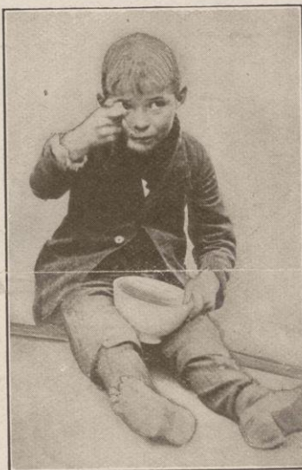
An orphan of France. This boy, whose father fell in battle, saw his mother slain by German soldiers. Today he must depend upon strangers for food and protection.

we have enjoyed for more than a hundred years. You have been told this before; you cannot be told too often, for we owe a debt to France that we may acknowledge but never can repay.