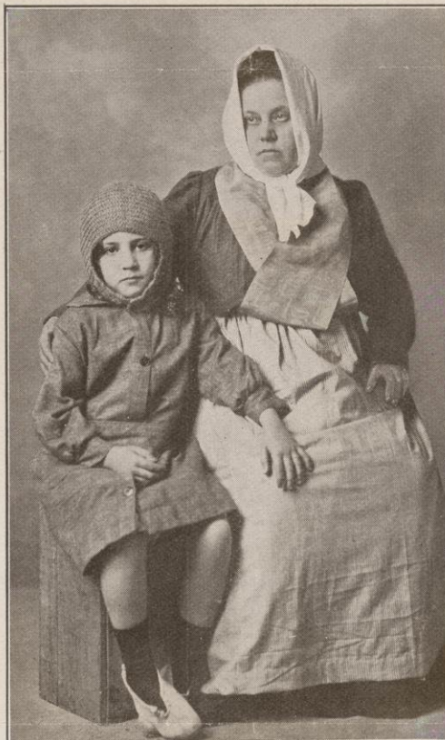
One of the rescued. Won't you help the many who today are destitute and suffering?

Send us a check by return mail for these children. It will make you a party to the biggest deed at the most critical hour the world has ever known.