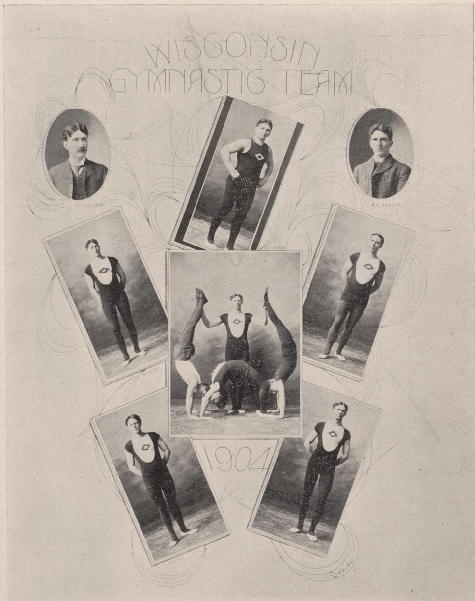
GYM TEAM. WESTERN INTERCOLLEGIATE GYMNASIIC CHAMPIONS 1904.