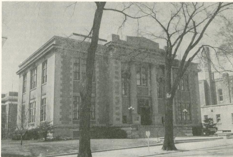
Manitowoc Public Library — County Training School on Second Floor — 1904 - 1922)