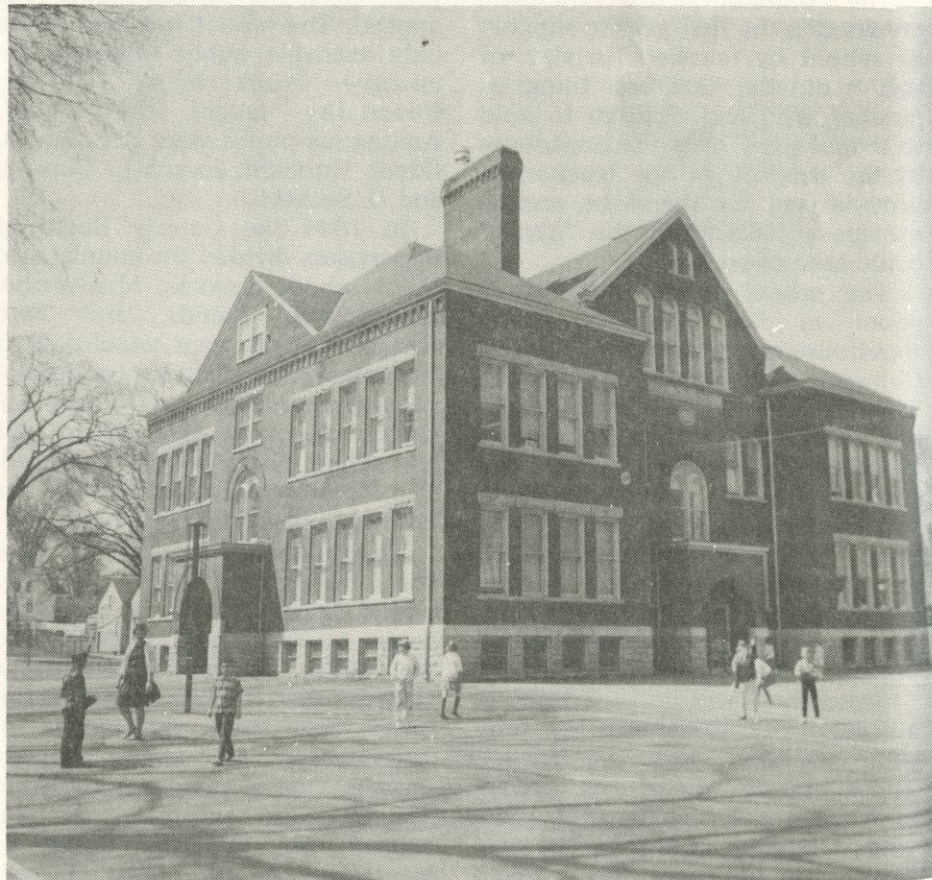
Garfield School — County Training School on Third Floor (present attic)

Earlier in this article mention was made that in some schools the German language was used, either entirely or in part. In October, 1866, an order was received from the State Superintendent of Schools which closed "the German department" in all schools. This caused a furor and much adverse comment. Although the order was given, a "loop hole" was discovered, and the teaching of German was continued in some schools for many years. It would have been almost impossible to carry out this order, for in German communities some children came to school with little or no knowledge at all of the English language, and so it was necessary that the teacher be able to use both the English and German language in her teaching. It was the only way that there could be communication at all under the circumstances.