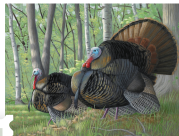
Caleb Metrich, Lake Tomahawk