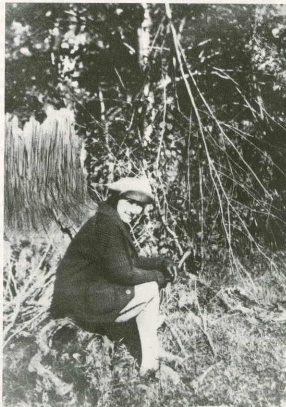
Blackened bottom of stump is a result of the 1871 Peshtigo Fire in northern Manitowoc County.