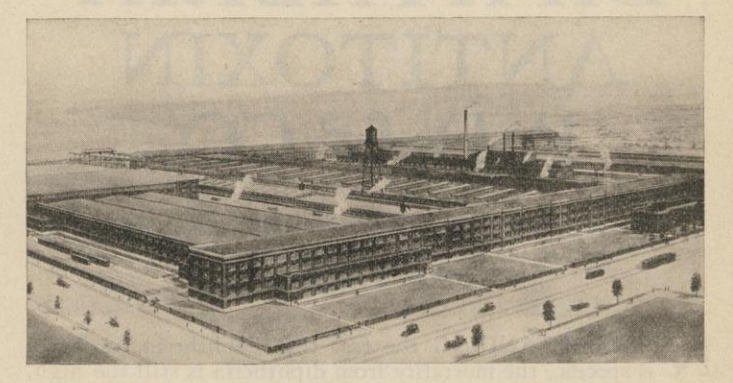
PLANT OF A. O. SMITH CORPORATION, MILWAUKEE, WISC. (One of the largest manufacturers of auto frames in this country)

Modern industry today is giving more and more attention to the health of its employees, and many have built up Departments for such welfare work.