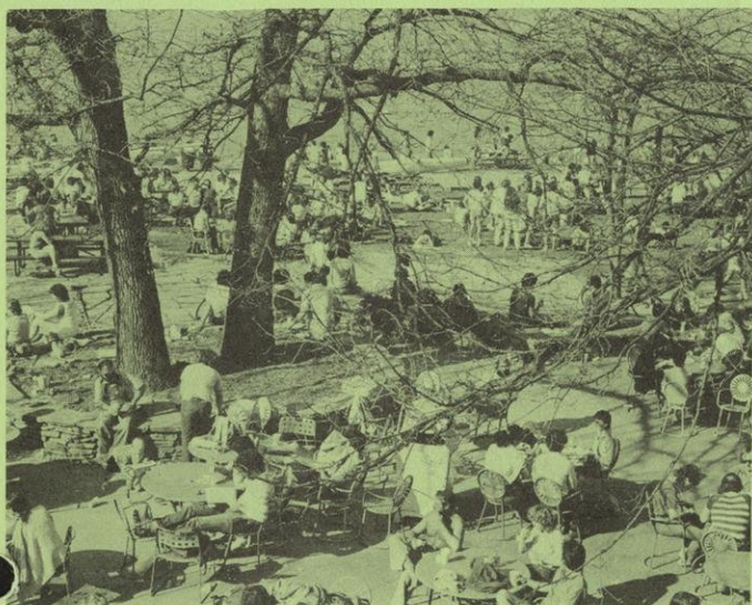
The Memorial Union Terrace on a warm spring day.