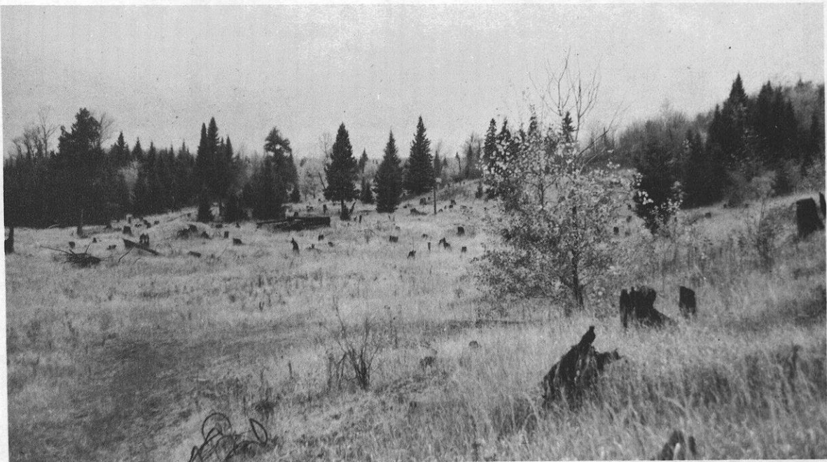
Camp opening. Most openings on loamy soils have resulted from some form of prolonged human and animal disturbance, such as logging camps, railroad landings, or homesteads. Similar openings are not being created by present land uses.