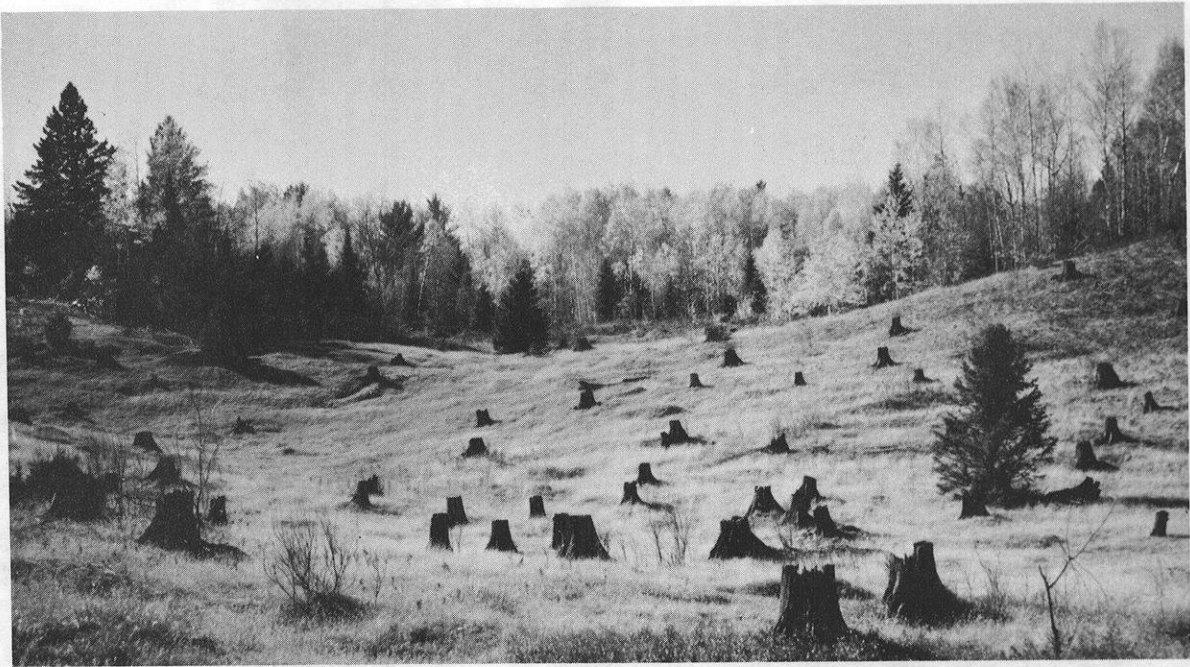
"Frost pocket" surrounded by northern hardwoods. Maintenance requirements in this type of opening are minimal. Esthetic values are often high, and deer use is generally comparable to other openings without major topographic influence.