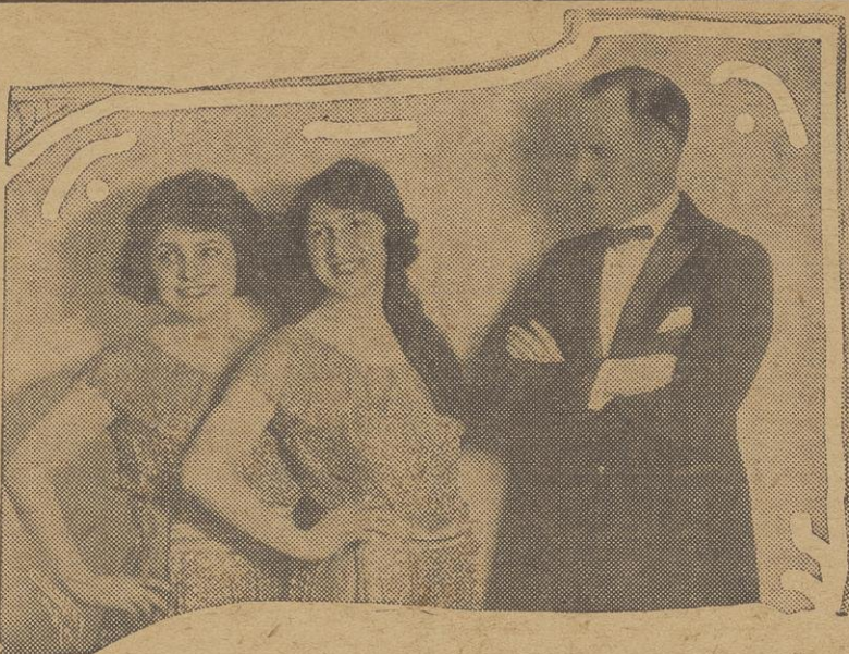
CRANSFIELD SISTERS AND REEVES IN "TWO SHARPS AND A FLAT" AT ORPHEUM TODAY.