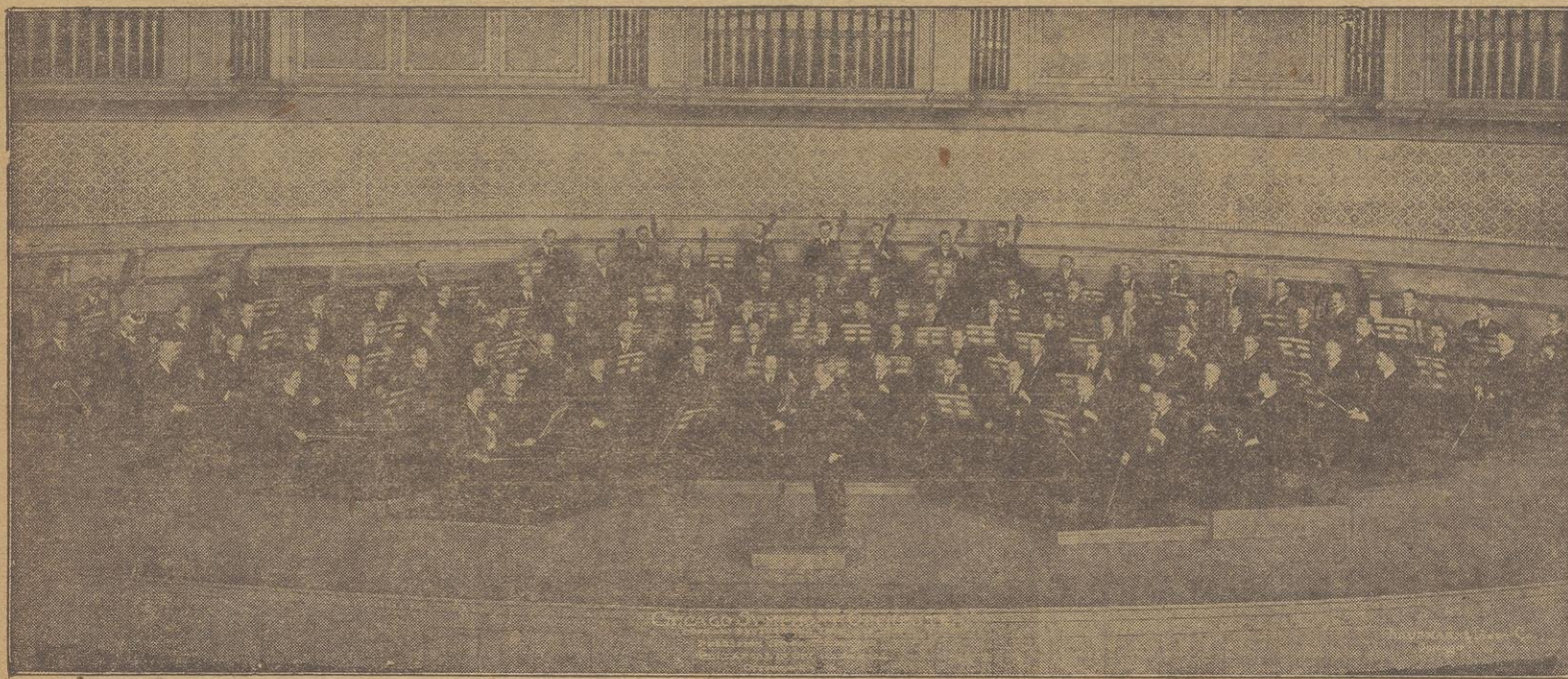
CHICAGO SYMPHONY ORCHESTRA HERE TUESDAY

Music - Travel - Literature - Painting - Poetry