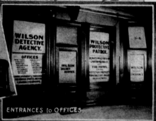
ENTRANCES to OFFICES