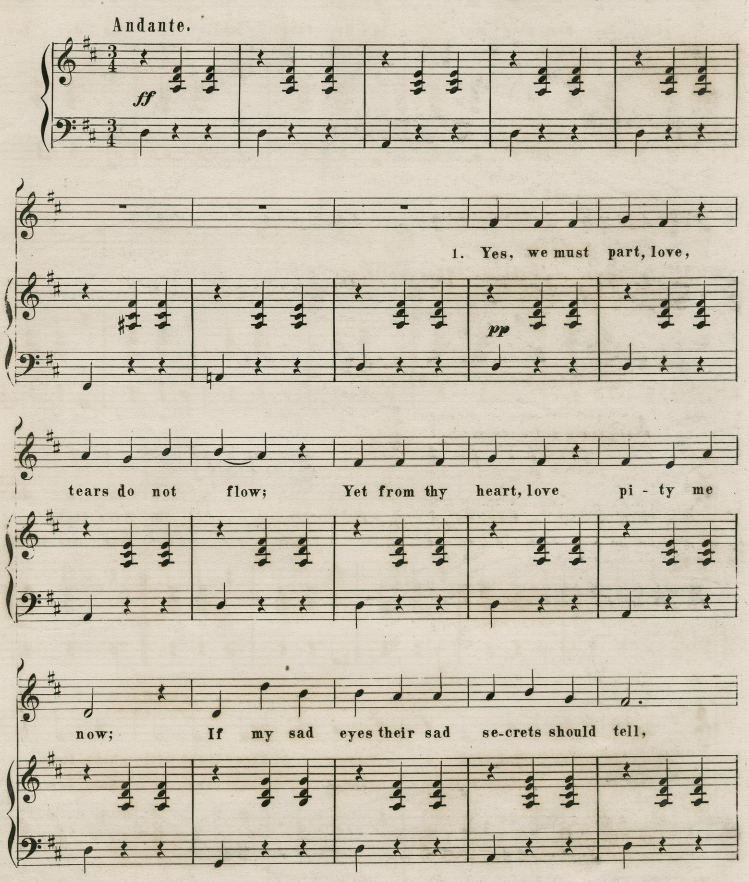
Twelve New Ballads by Claribel, Nº 4.