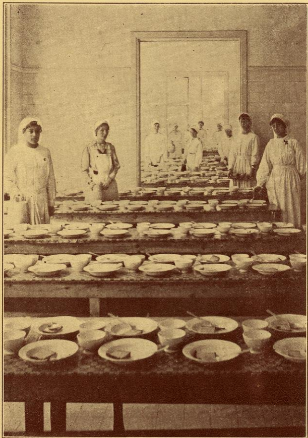
Ready for the Children.