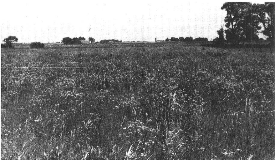
No partridge nests were found in wetlands—the cover type most attractive to pheasants.

In contrast to pheasants, partridge did not exhibit major shifts in population distribution between winter and summer range. In most winters, pheasants abandoned nearly all upland portions of the study area and concentrated in wetland sites where the heaviest winter cover was available. Partridge, on the other hand, tended to remain year-long on the uplands, apparently finding adequate winter shelter in open fields and in the few brushy thickets present along fencelines and roadsides. At least in winter, it was evident that partridge were much better adapted to near-absence of permanent cover than pheasants.