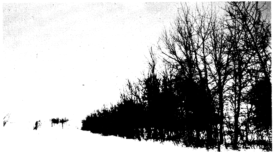
During the winter, partridge remained in upland areas such as this fencerow. In spite of marked annual differences in snow cover, winter partridge survival appeared constant between years.

In summary, I conclude that winter partridge mortality was generally light and nonvariable between years and, therefore, played an unimportant role in population fluctuation. The picture contrasted sharply with pheasants, a species in which winter loss was highly variable between years, and winter weather exerted predominant control over population trends (Gates, 1971). Hammond (1941), in North Dakota, also indicated that partridge were better adapted to deep snow and subzero temperatures than pheasants. In Iowa during the severe winter of 1935-36, Green and Hendrickson (1938) observed 48 percent mortality among pheasants, but reported negligible loss of partridge.