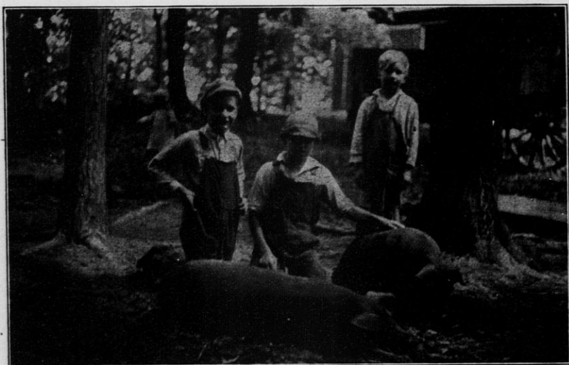
GROWING PURE BREDS

There is nothing more attractive to the average American boy than a business proposition, and he doesn't always wait until finishing his education before making a decision on what that business is to be. Most boys have their minds made up early in life though many do not eventually follow the line first chosen because of circumstances or surroundings which lead them in other directions. To have an ambition to accomplish something or be someone of importance is a characteristic most commendable. But in order to be a success in your chosen profession one needs all the training and experience he can get early in life. The important thing then, is to select your vocation carefully so that it will not be necessary to change later in life.