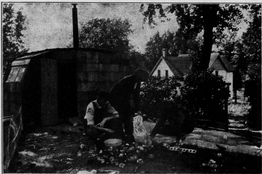
A SMALL BUSINESS WITH GREAT POSSIBILITIES.