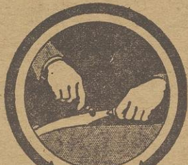
Premier Knife & Scissors Sharpener

Premier Mfg. Co., 806 U East Grand Boulevard, Detroit, Mich.