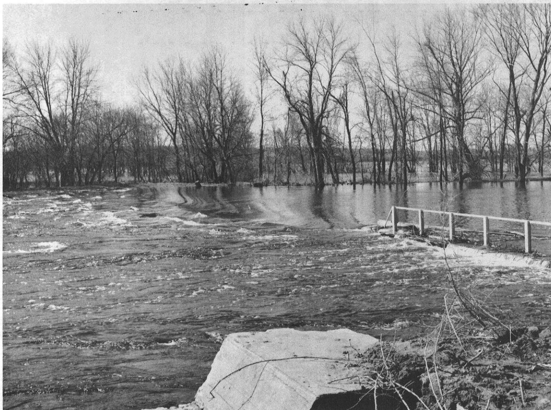
Eureka Dam, Fox River