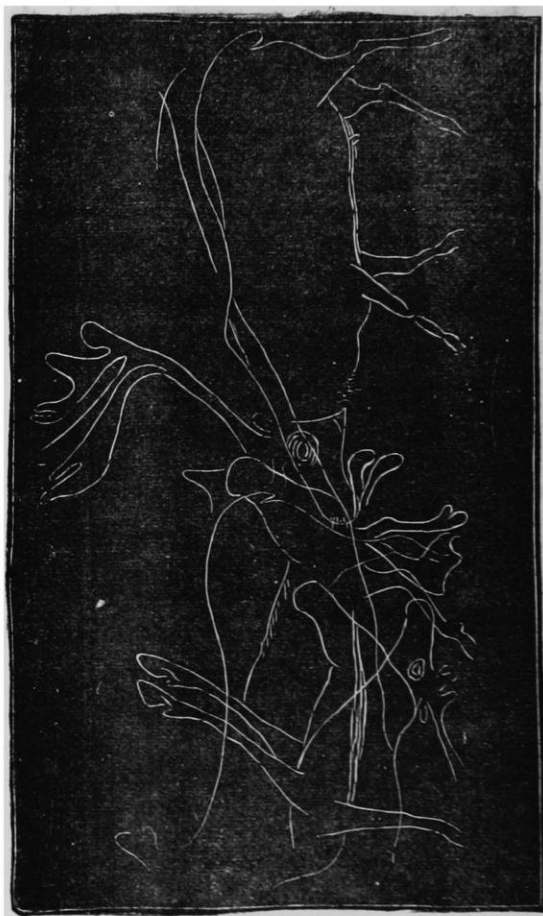
FIG. 22.—Combat of Reindeer.

were all foreign to the locality. Most of them belonged to the species Littorina littorea , and came from the shores of the Atlantic, where they are still very abundant. They were brought quite fresh, for they had their natural colours, which are preserved to this day in the floors of the caves. Other shells pierced in like manner with one hole, belong to five extinct species only to be found in faluns , and which date from the Miocene epoch. They are quite discoloured and broken into molecules; and the traces of rolling which they sometimes present, prove that they were fossils long before they were extracted from their tertiary beds to ornament man. Now the faluns which contain these five species are not found in the region of the Vézère. The nearest are those of Touraine, and it was from thence, in all probability, that our Troglodytes imported this toilet necessary. There have been likewise found in three stations, and principally at Upper Laugerie, little pieces of rock crystal; this substance must have come from the Pyrenees, the Alps, or