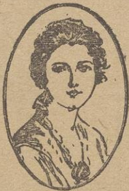
Betty Wales Dresses and Betty Wales Coats Are Uncondi- tionally Guaranteed

AN air of radiant good-fellowship hovers over the wearer of either of these cheerful little Betty Wales models, one of marcellette crepe with pleated panels on the skirt—the other of canton crepe with an all over pattern of beading in rings.