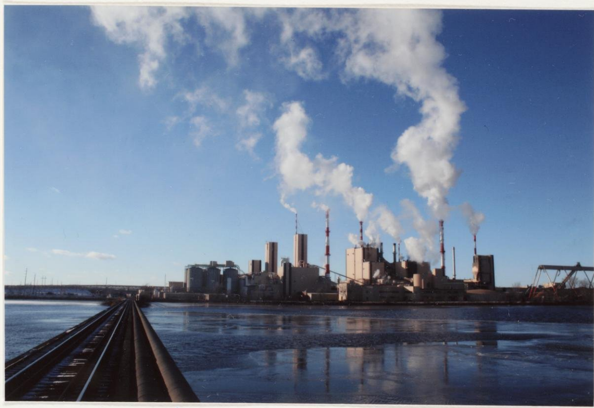
"Stora Enso - downtown mill" www.markwattymemind.com