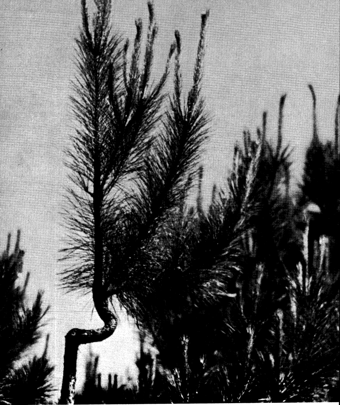
"Posthorn" caused by European pine shoot moth.

Neiswander, 1955). In Wisconsin, spraying to control newly emerged larvae should begin when empty pupal cases are evident or when adults are observed among the pines. This would occur when new red pine needles are approximately one-half the length of previous years'