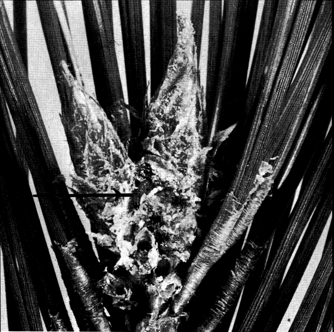
European pine shoot moth larvae emerging from mined-out red pine bud.

occurs in late June and early July and mating takes place soon after. Moths generally fly after dark during periods of calm or light wind. Flights of a few hundred feet are common, but females rarely migrate far afield. Unless infested nursery stock is involved, natural spread is slow. Since the shoot moth has but a single generation per year, population build-up is slow.