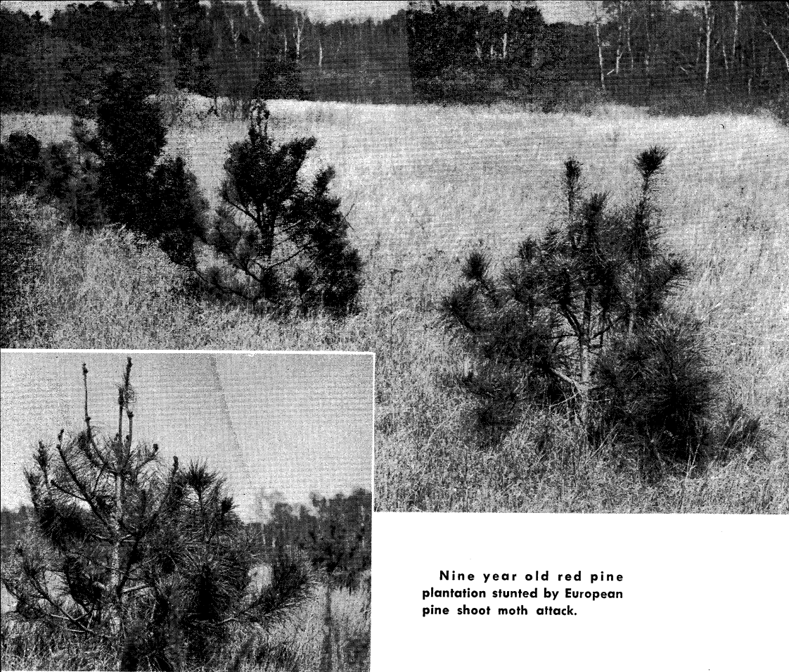
Nine year old red pine plantation stunted by European pine shoot moth attack.