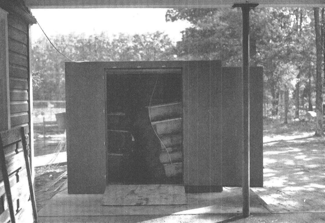
Small portable plywood fumigation chamber for methyl bromide treatment of pine seedlings.

nearest degree F. should be taken in two places (top and bottom) of the chamber free space, and also in at least six bales (among the pine foliage) in different parts of the load.