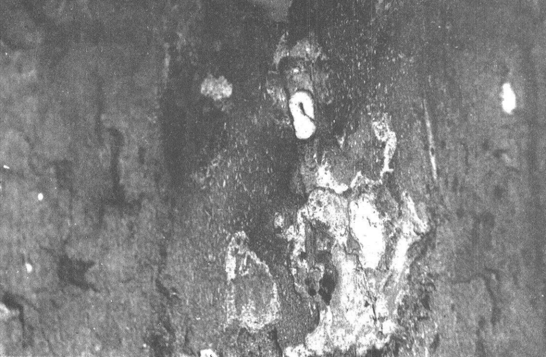
A mature hemlock borer larva in its pupal cell in the bark, ready for winter.

The larvae travel in many directions, and their paths may criss-cross. When the insects are numerous, such boring girdles the tree. After molting four times, the larva re-enters the bark and constructs a pupal cell. Here, doubled upon itself, it passes the winter.