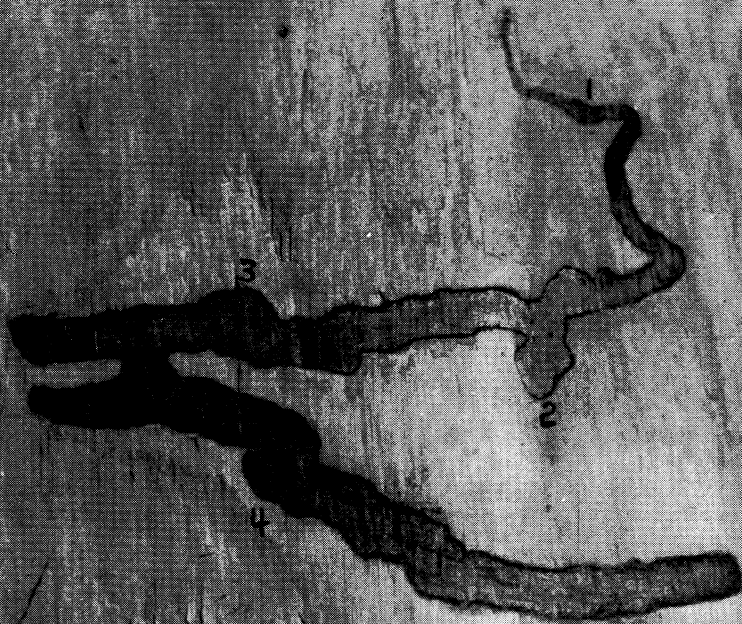
A mine made by the larva of the hemlock borer in the cambium. The numbers show the points at which molting of the larva occurred.

The life cycle may require either one or two years, depending upon the time the eggs are laid. Those insects developing from eggs laid in June or July complete their development in one year. Young larvae emerging from eggs laid in August spend the first winter in the cambium region and the second in the pupal cell, thus requiring nearly two years for completion of the cycle.