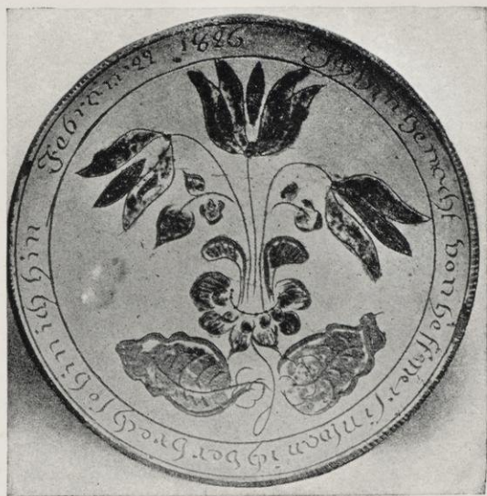
21. SGRAFFITO PIE PLATE (9 inches). With Tulip Decoration. Made by Johannes Neesz, 1826.