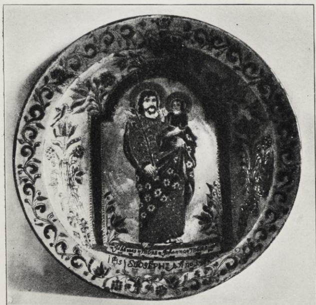
3. SGRAFFITO DISH (26 inches). German Luxembourg, 1713.

Trumbull-Prine Collection, Princeton University.