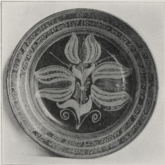
32. SLIP-DECORATED SHAVING BASIN (8 inches). Eastern Pennsylvania, c. 1750.