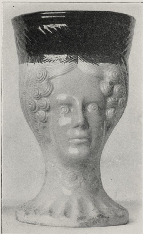
42. LEAD GLAZED STOVE REST (6½ inches in height). Germany, Eighteenth Century.