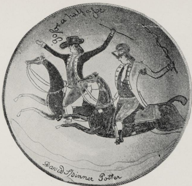
19. SIGNED SGRAFFITO PIE PLATE (11½ inches). A Horse Race. By David Spinner, about 1800