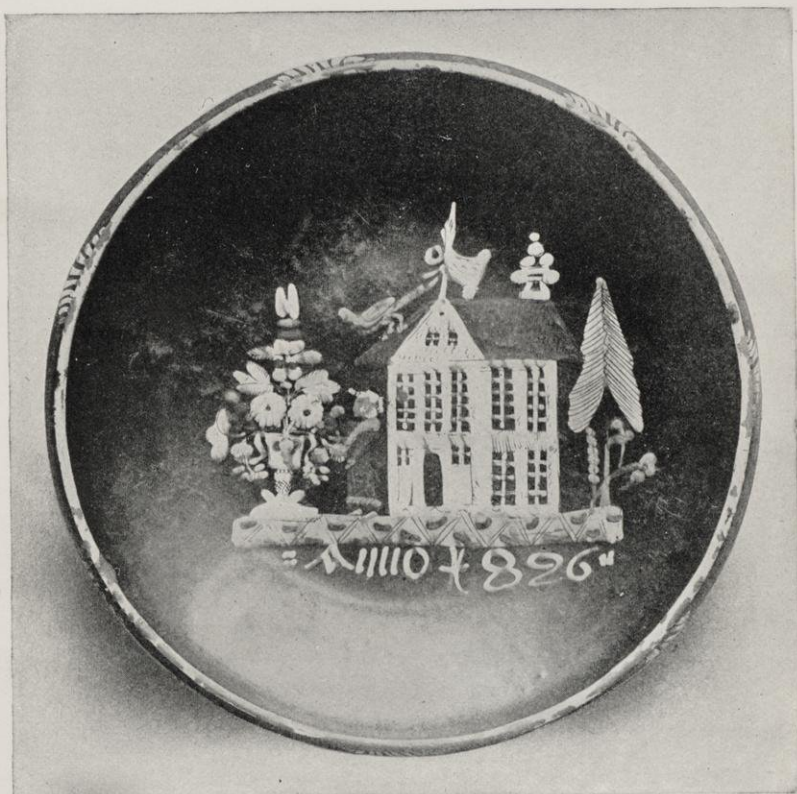
27. SLIP-DECORATED DISH (15 inches). Germany, 1629.