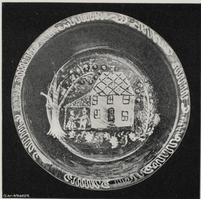
37. SLIP-DECORATED DEEP DISH (13 inches). Polychrome Decoration on Chocolate-colored Ground. Southeastern Pennsylvania, c. 1840.