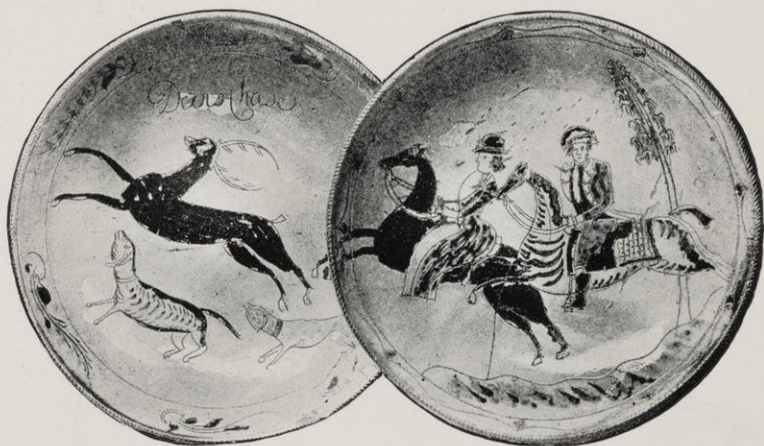
16. SGRAFFITO PIE PLATE (11½ inches). With Human Figures. Made by David Spinner, about 1800.