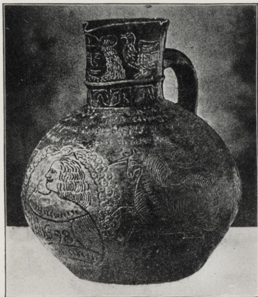
7. SGRAFFITO JUG (12 inches in height). Devonshire, England, 1698.