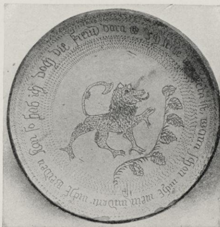
25. SGRAFFITO PIE PLATE (8½ inches). Made by Friedrich Hildebrand, c. 1830.