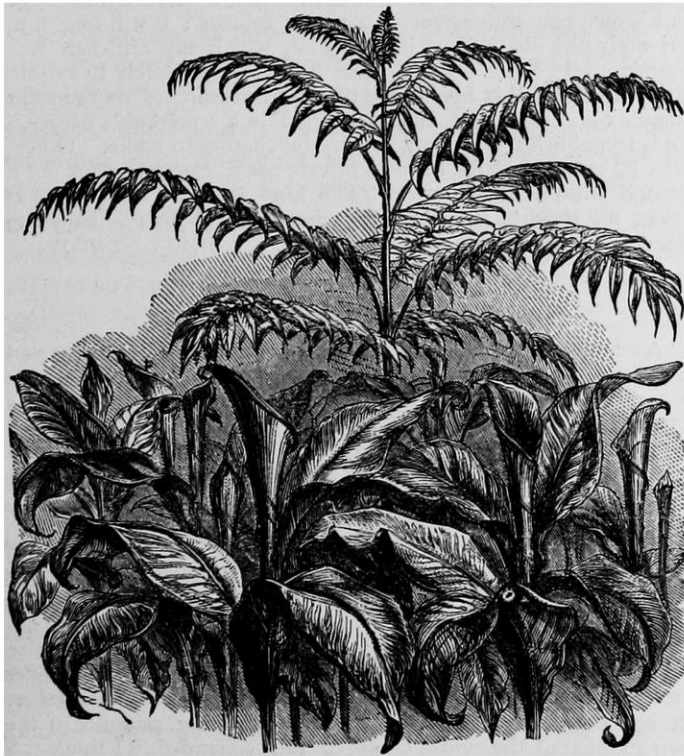
AILANTUS AND CANNAS

THIS volume is a sequel to the valuable works which Mr. Robinson has already given us—"The Wild Garden," and "Alpine Flowers for English Gardens." The title is a misleading one, and is thus defined by the author:—"Sub-tropical gardening means the culture of plants with large and graceful or remarkable foliage or habit, and the association of them with the usually low-growing and brilliant flowering-plants now so common in our gardens, and which frequently eradicate every trace of beauty of form therein, making the flower-garden a thing of large masses of colour only." It is a pity that Mr. Robinson has assisted to perpetuate so erroneous a designation, which conveys the idea of the culture of tender plants fitted only for our hothouses. The greater part of the volume is occupied with an alphabetical list of plants suitable for the above purpose, with description of the peculiarities of their foliage, mode of cultivation, and propagation, &c. The accompanying cut is intended to suggest the effects to be obtained from young and vigorous specimens of hardy, fine-leaved trees. In all these points Mr. Robinson