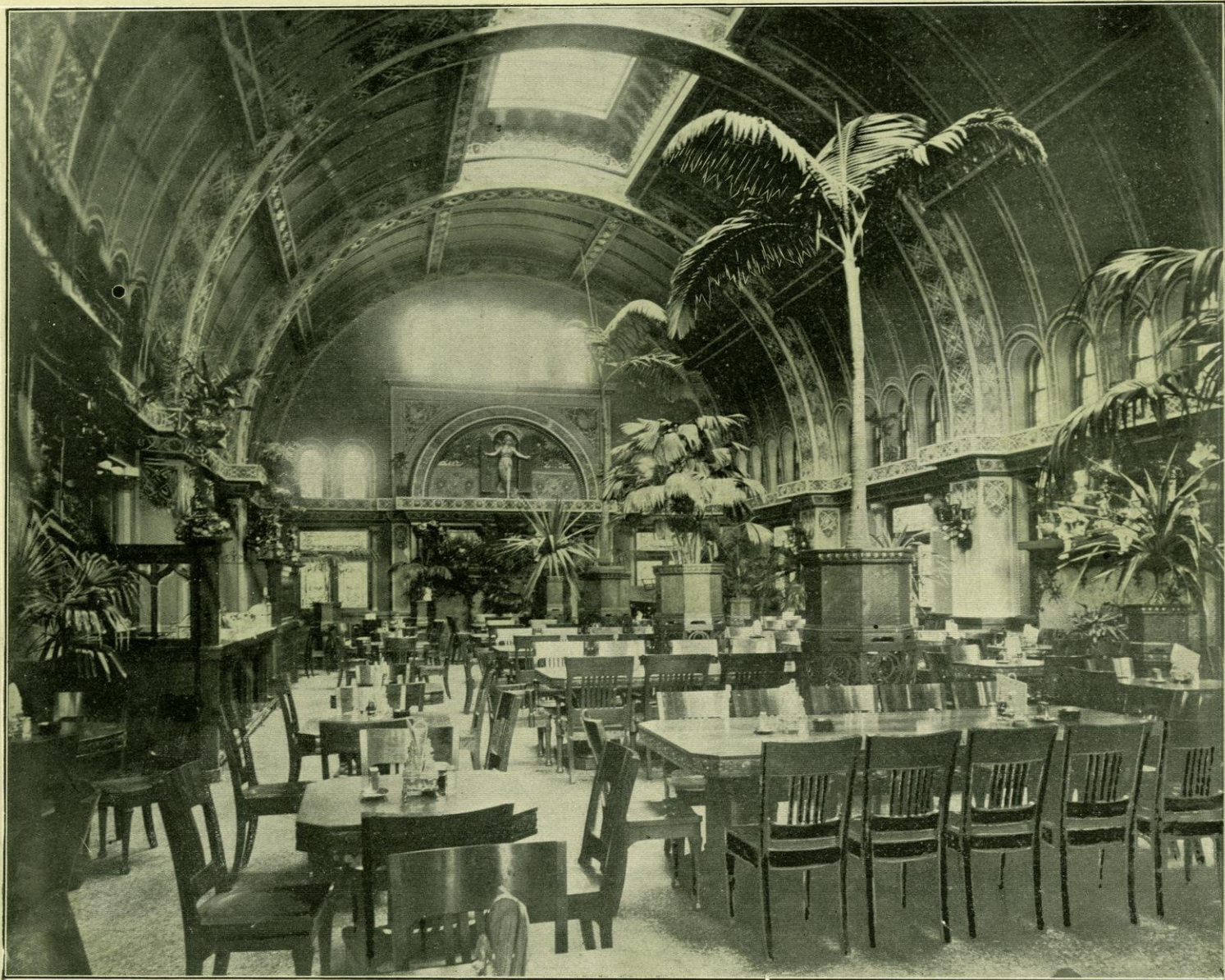
INTERIOR VIEW OF THE SCHLITZ PALM GARDEN, MILWAUKEE, WIS.