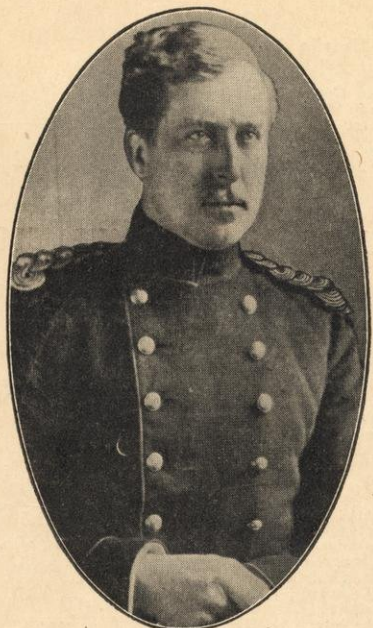
KING ALBERT OF BELGIUM