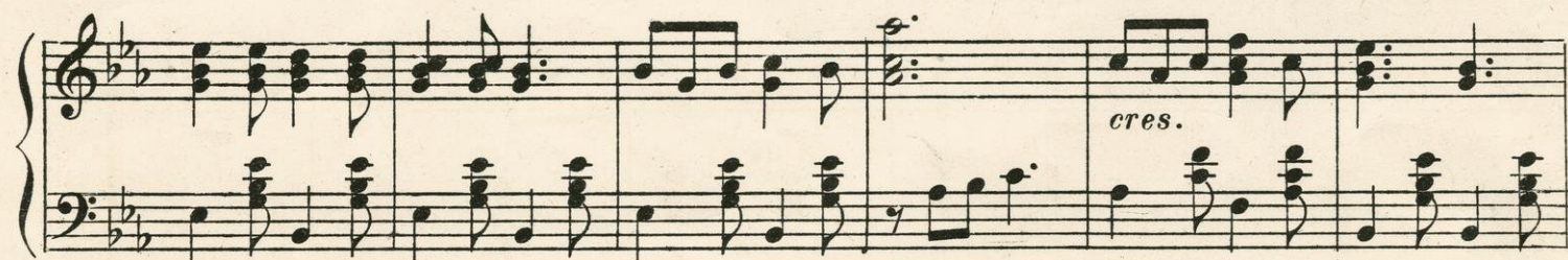
The College Two Step . 4

Brooke's Triumphal March. Played by the Chicago Marine Band, the greatest March published.