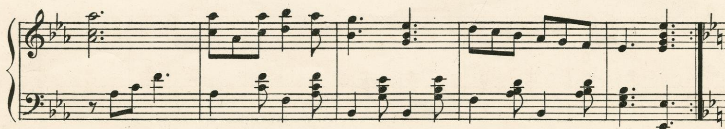
The College Two Step. 4

"Sousa's Band March," THE LATEST SUCCESS, ASK FOR IT.