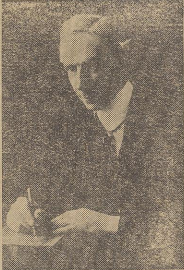
HON. TERTRAND RUSSELL