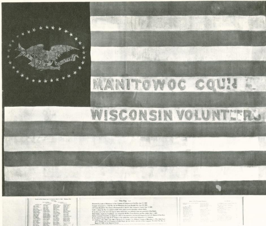
The Flag of Company A as it is presently displayed in the north entrance hallway of the Manitowoc County Courthouse.