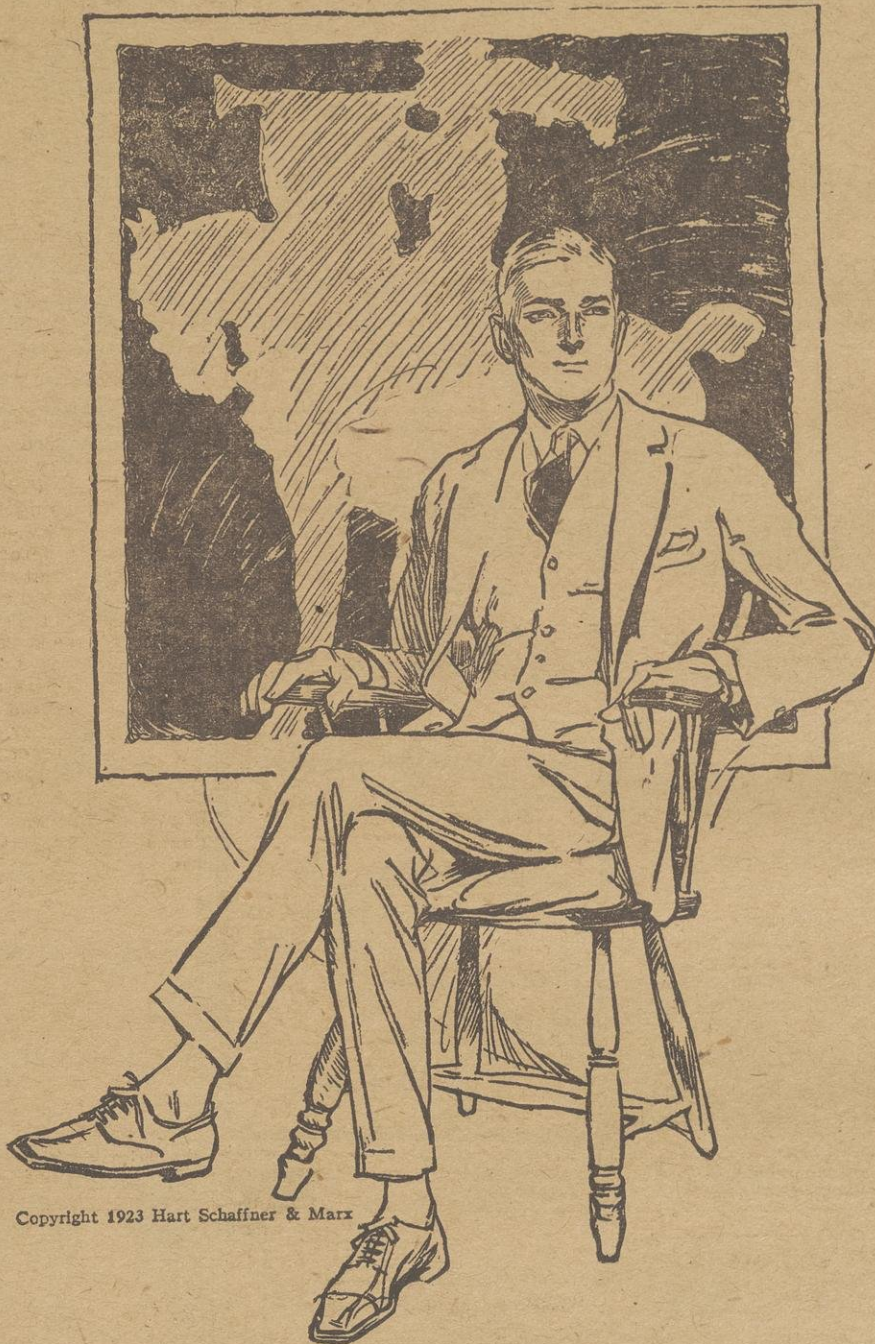
Copyright 1923 Hart Schaffner &amp; Marx

No Pythia meeting will be held this week on account of the all university religious council.