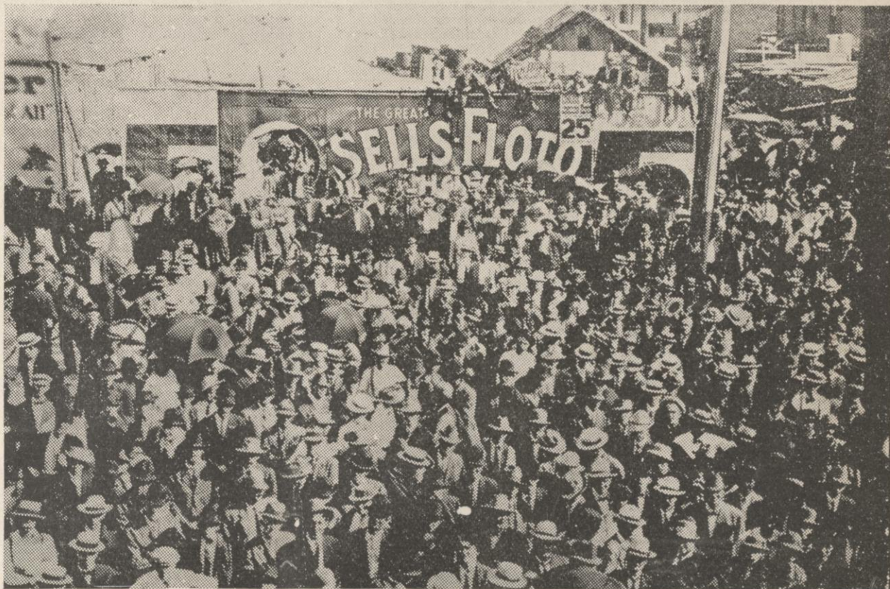
A Scene in Front Before the Opening of the Afternoon Performance at Wichita, Kan., Tuesday, July 12.

The Sells-Floto engagement at Wichita, Kan., on July 12 established a record for circus success in that city. Long before the gong rang for the beginning of both afternoon and evening performances, the big top was filled to its greatest capacity and